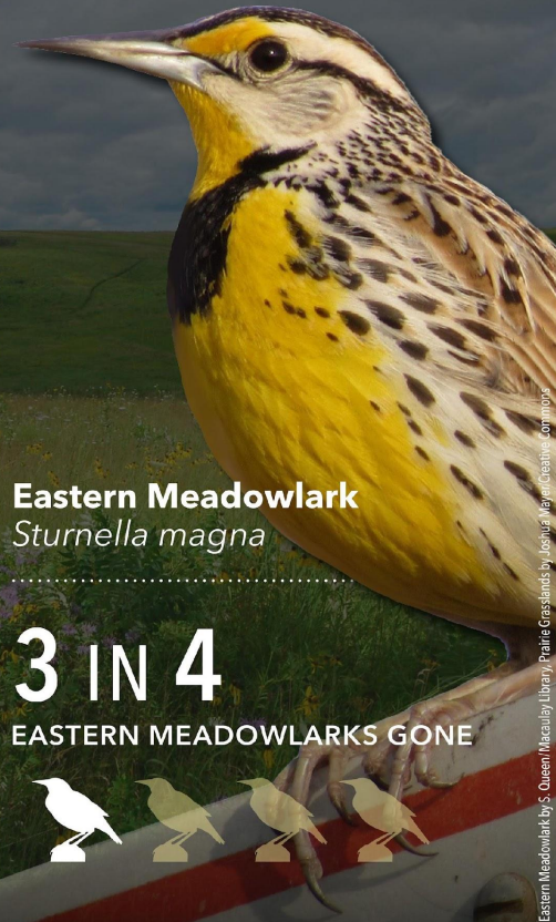
Eastern Meadowlark Sturnella magna